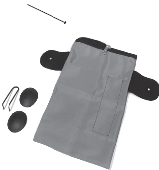
Inner organizer (only in Zip-City size M)

4,5* stars by www.road.cc (UK), September 2008