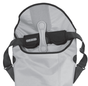
Internal view: fixing of shoulder strap during biking