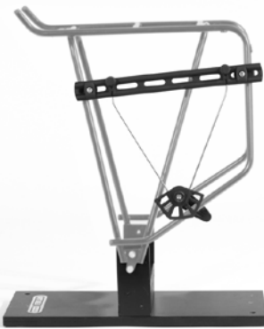
QL3 mounting elements