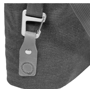
Detail: fixing of shoulder strap by means of snap hook