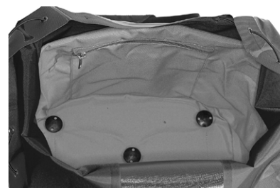
Zippered inner pocket