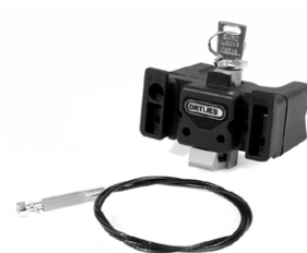
Handlebar mounting included