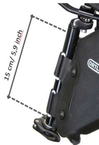
Space required for mounting Seat-Pack Limited Edition 16.5 L to the seat post