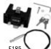
E185 Handlebar Mounting-Set with Lock