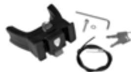
E207 Handlebar Mounting-Set E-Bike with Lock