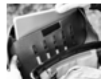
Opening lid compartment: 20,5cm / 8.1in.

Handlebar mounting-set (sold separately):