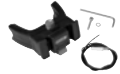
E226 Handlebar Mounting-Set E-Bike