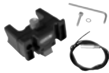
E225 Handlebar Mounting-Set