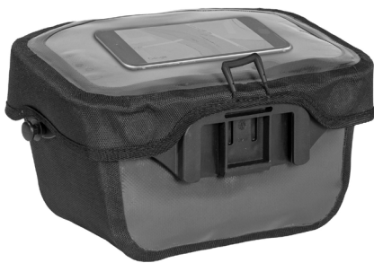
Smartphone in transparent lid compartment (not included)