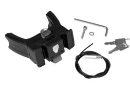
E207 Handlebar Mounting-Set E-Bike with Lock