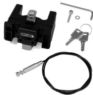
E185 Handlebar Mounting-Set with Lock