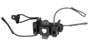
E241 Handlebar Mounting-Set QR

Handlebar mounting-set (sold separately):