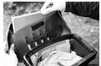
Opening lid compartment: 20,5cm / 8.1in.