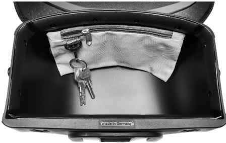
Carabiner with key chain

Handlebar mounting-set (sold separately):