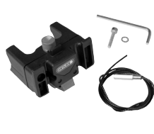
E225 Handlebar Mounting-Set