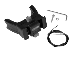
E226 Handlebar Mounting-Set E-Bike