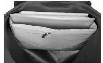
Inner pocket for laptops