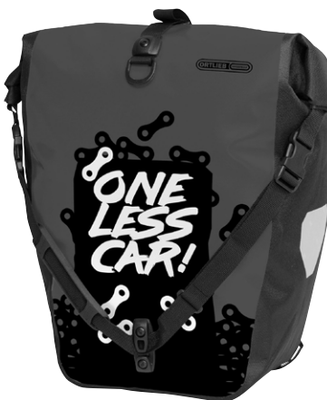
Design „One Less Car“