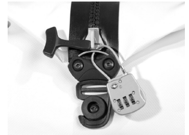
Wire loop for locking the bag with padlock (padlock not included)

Bergsteiger TIP Proofness, mountaineering magazine Bergsteiger, February 2011